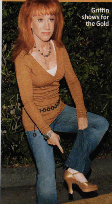
Griffin shows for the Gold

PARTY TIME As you’d expect, there was a sense of “gold fever” at the launch party for AOL’s online reality game Gold Rush ( aol.com/goldrush ). Gathering at Hollywood’s Les Deux Cafe were Entertainment Tonight ’s Mark Steines (the Gold Rush host) along with Felicity Huffman, Tori Spelling, Laguna Beach ’s Kristin Cavallari and D-Lister Kathy Griffin, who will be playing the game online and posting to the game blog—or glog, as they’re calling it. “It will be like Big Brother ,” says Griffin, “where I won’t leave my house for seven months and I won’t shower.” And, knowing where her pop-culture prowess lies, she adds, “I hope there will be gay questions because I excel at that. Questions about Cher and Manilow.”